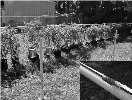
Fig. 1. Partial view of simulated backyard framed by a 1.2-m-high polyvinyl chloride pipe perimeter "fence" with potted wax myrtle bushes. In the foreground are cylindrical wire mesh cages suspended from wooden stakes used for the wire cage bioassays. Inset shows 1 of the 18 Hago spray nozzles that applied synergized pyrethrins from a Model Gen 1.2 MistAway® automatic-timed misting system.