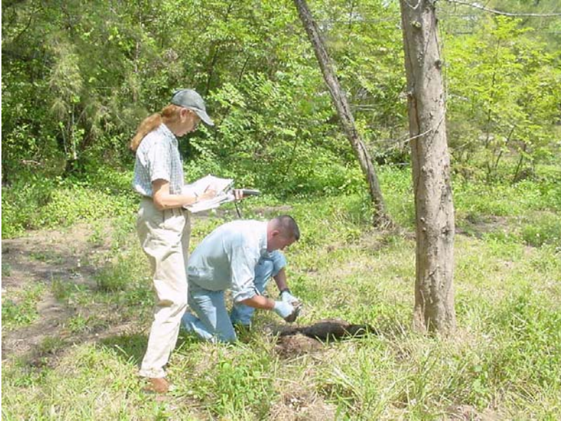
Figure 15. Collecting pre-application soil sample, Sector 3.