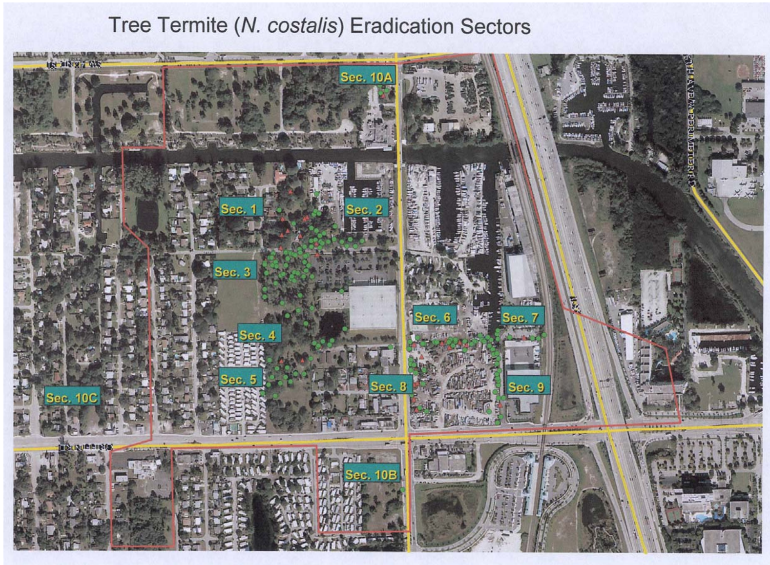
Figure 2. Eradication sectors